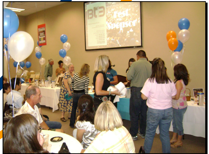
Receptions and parties welcome