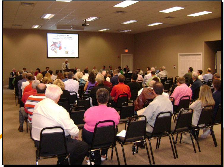
Professional theatre setup

Weekday seminar $50—$100 (Call for details)