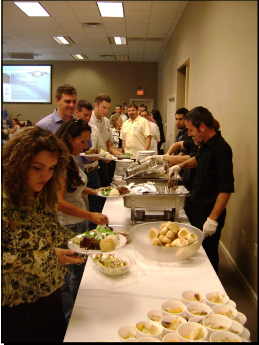
Preferred catering available