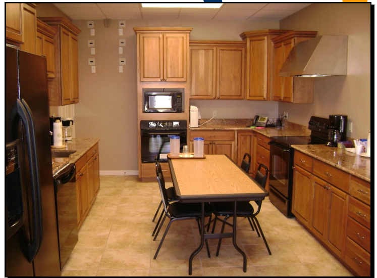
Staging kitchen facilities